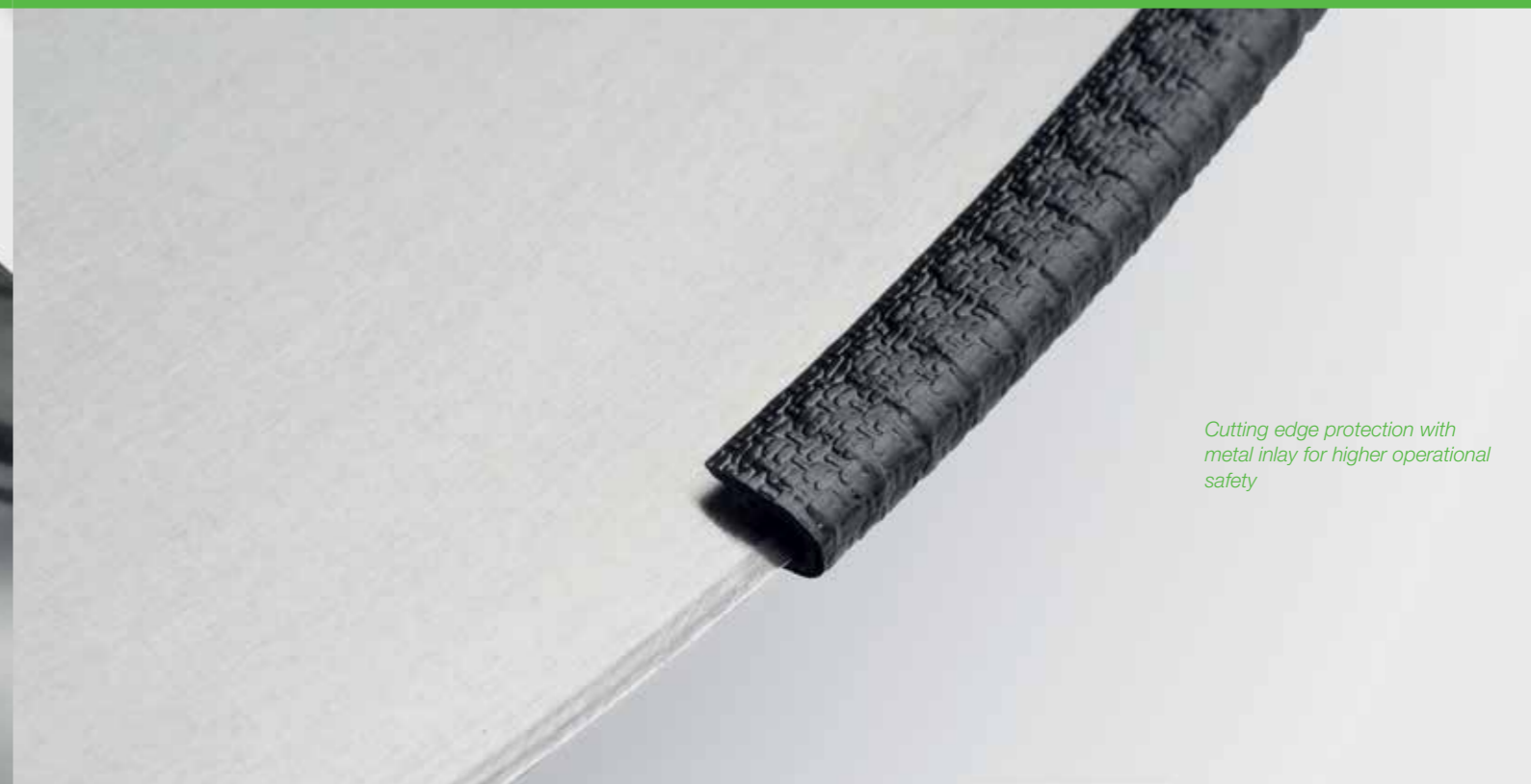
Cutting edge protection with metal inlay for higher operational safety