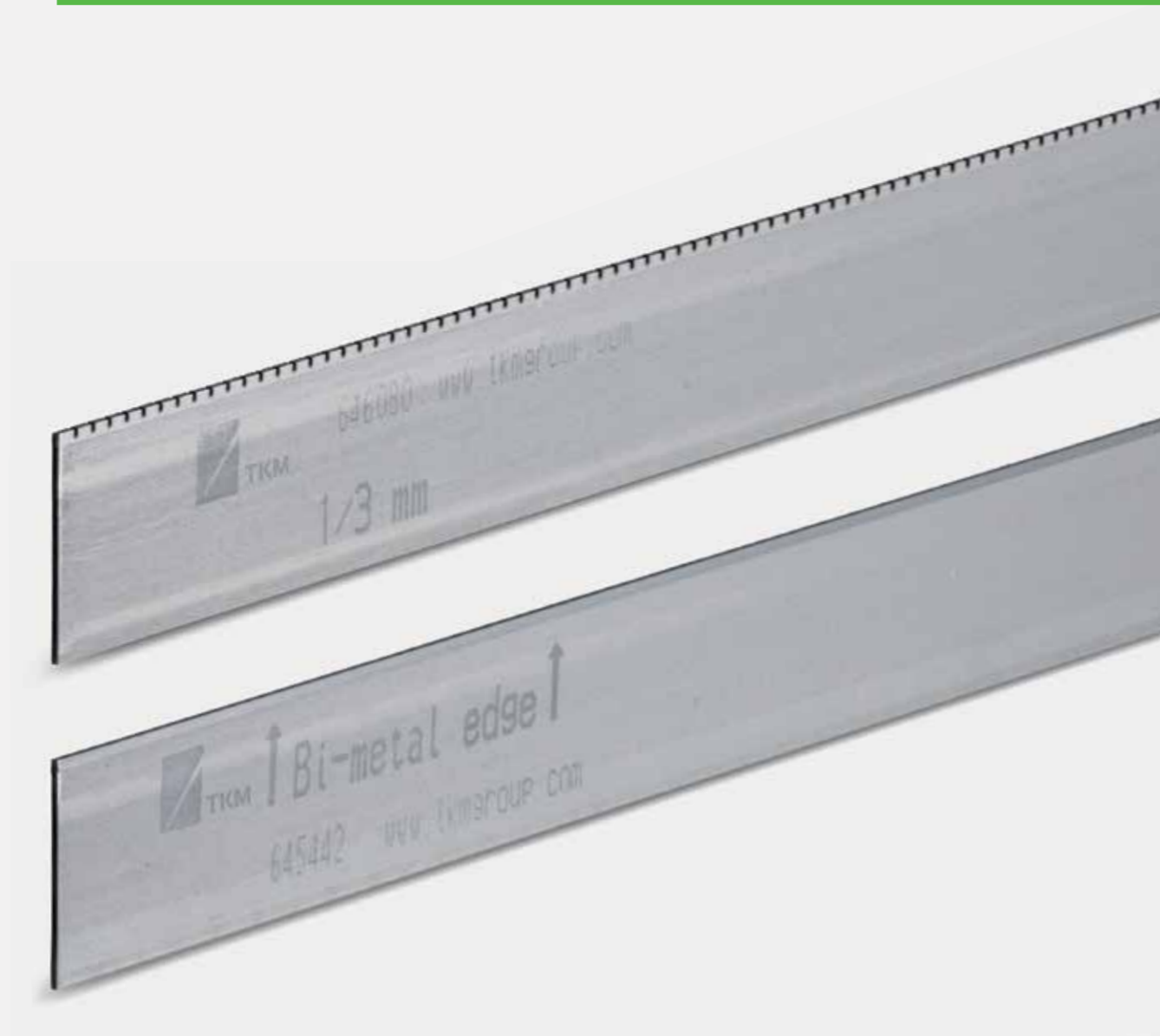
Perforation and anvil knives for all contemporary machines.