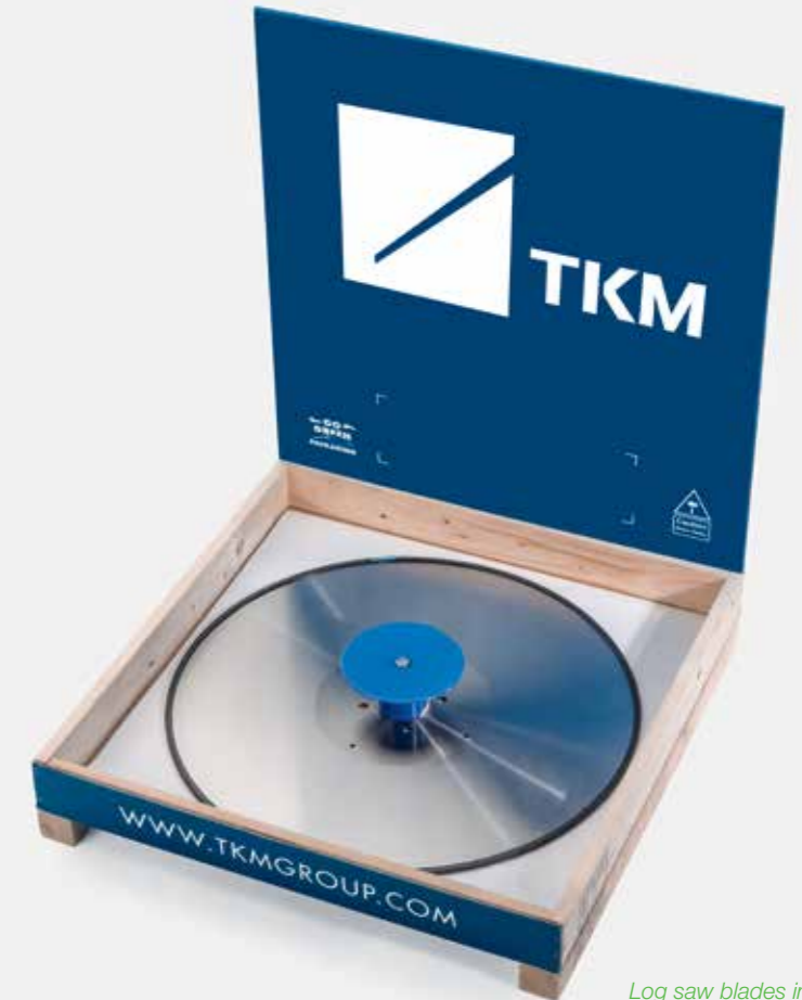
Log saw blades in crate